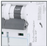
possibility of sealing